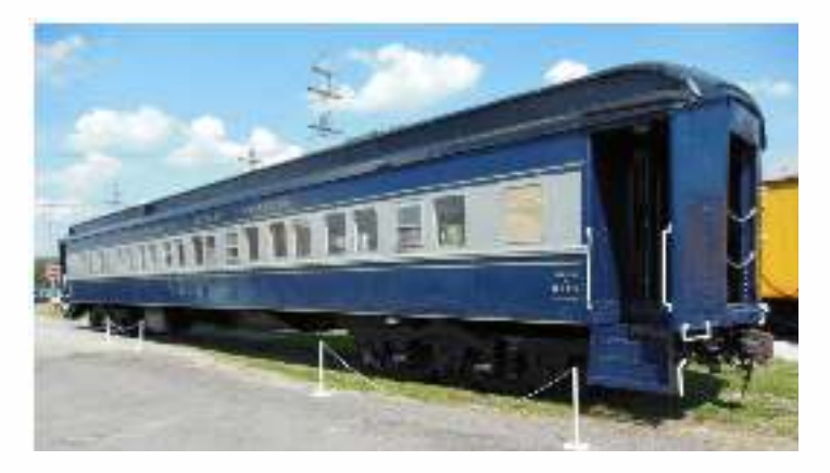
We lease Locomotives and we also lease out 3 Pullman coaches with open windows with HEP and heating systems. We offer service to update your Passenger car

Rebuilt and old B&O coach for a customer other work include Cabooses and painting for CVSR